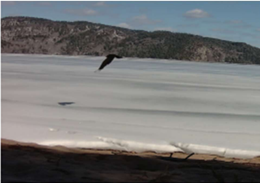
Golden Eagle flies over Pointe au Baptême, Oiseau Rock in background