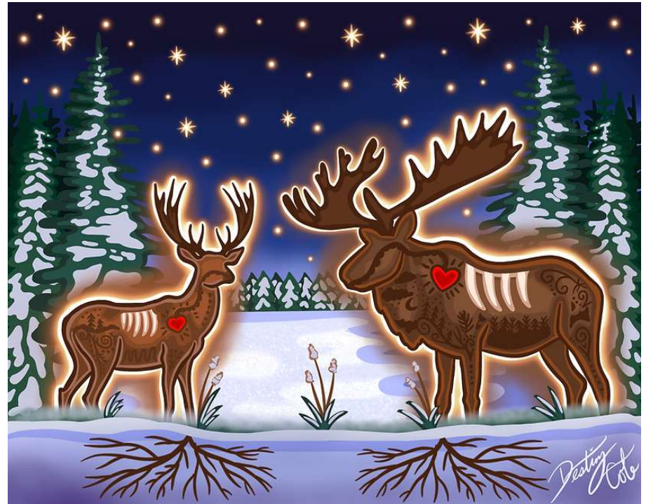
Artwork by Destiny Cote