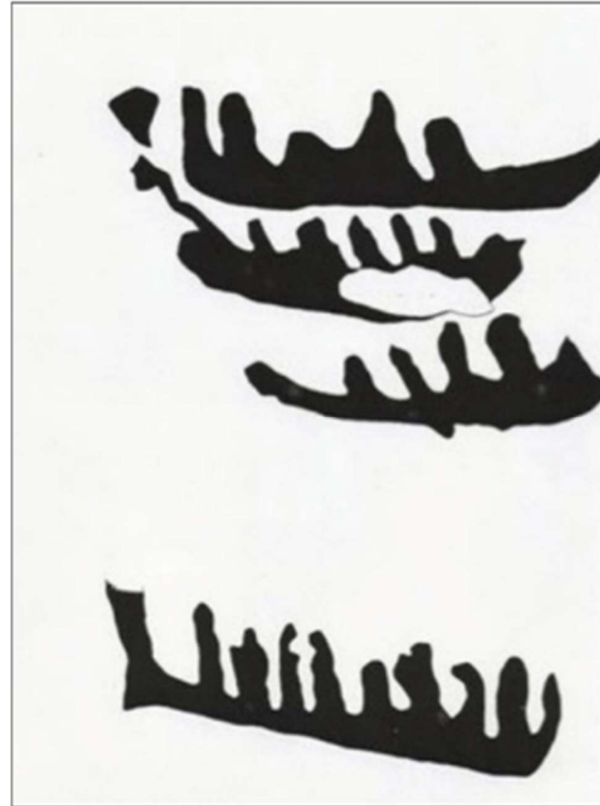
Anishinabeg pictograph at Oiseau Rock

*Added in response to community feedback